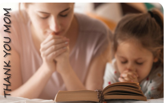
thank you for teaching ine to pray and have faith in my Lord, Jesus.